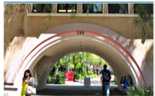
Summer Session B, Building 230 arch

The closest parking structure to our suite is Social Science Parking Structure. The best bus lines are C, M, and N; the best bus stop is University Center-South. Here is a link to one of UCI's sustainable transportation options, the Anteatr Express, with live bus tracking.